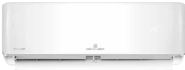
KSV50HRG, KSD50HRG, KSV70HRG, KSD70HRG, KSV80HRG, KSD80HRG