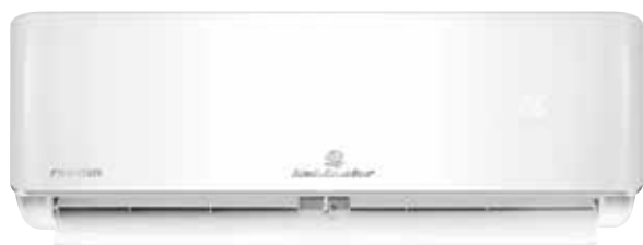
KSV25HRG, KSD25HRG, KSV35HRG, KSD35HRG