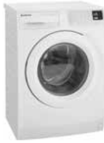
SWF8025DQWA EZI set