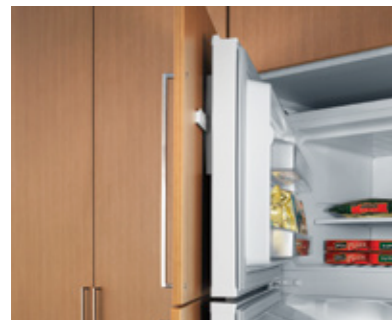
Specialised 120° wide opening hinges